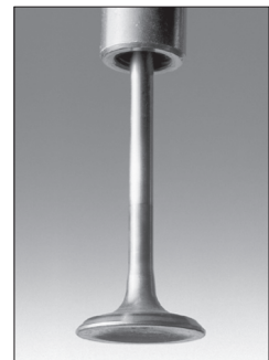
CLEAN INTAKE VALVE

The photo at right is an example of a clean intake valve, allowing maximum driveability and fuel economy with minimum emissions.