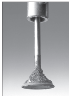
DIRTY INTAKE VALVE

The photo at right is an example of intake valve deposits that can disrupt fuel flow, leading to decreased driveability and fuel economy, and increased emissions.